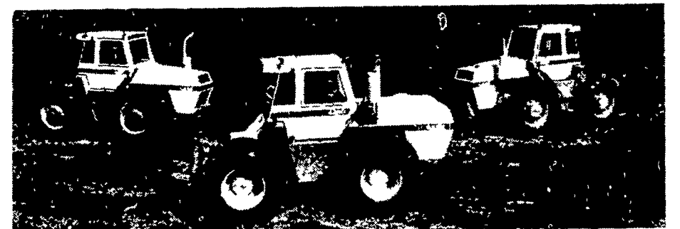
Model 4690: 256 eng hp* (191 kW) PTO 219 hp* (163 kW)