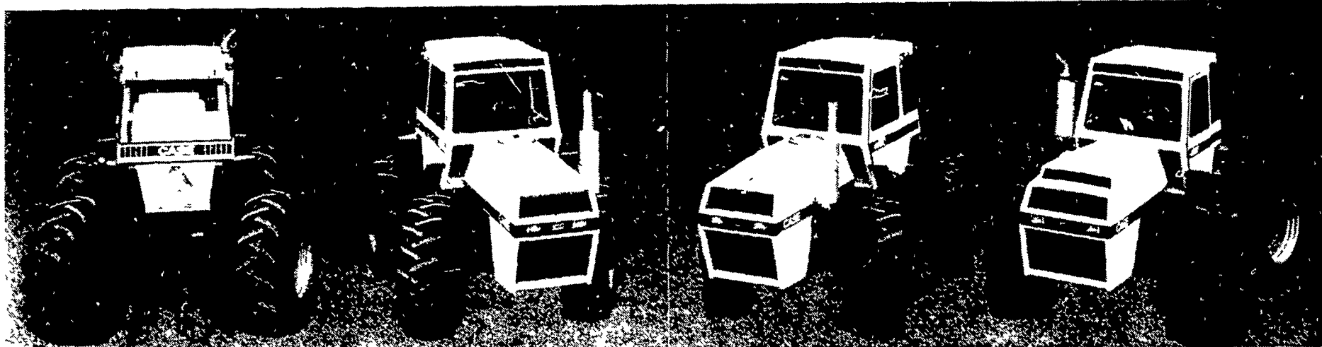
Rear wheel steering