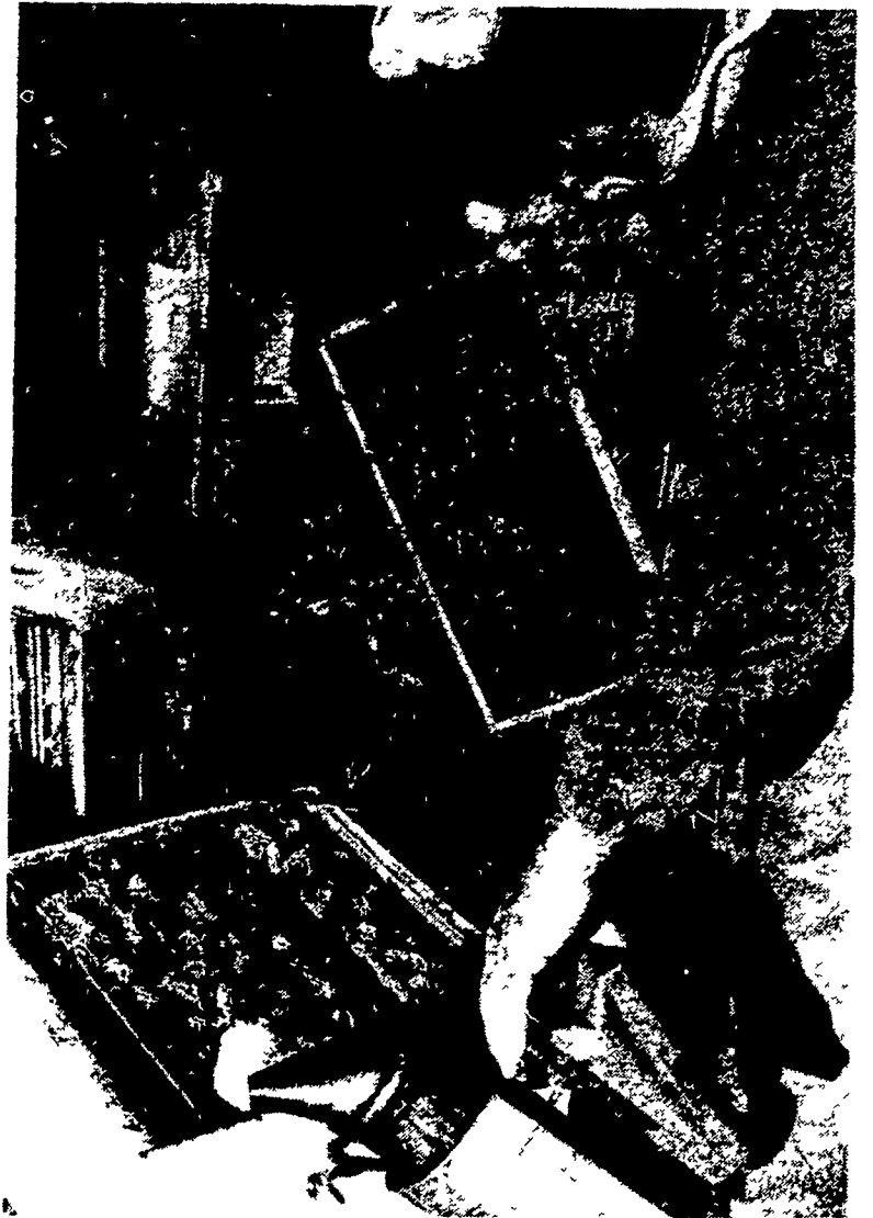
A puff of smoke releases its calming effect on the bees as Brossman examines the frames stored inside the bottom super. The bees continue to work on the frames he holds, feeding the young a mixture of honey, pollen and water.

"Without honey bees, there'd be no honey, no fruit, nothing," states Brossman.