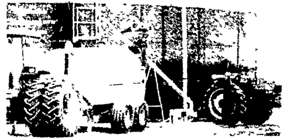
An answer to the manure handling dilemma

A TOTAL MANURE HANDLING SYSTEM... THE SLURRYSTORE SYSTEM