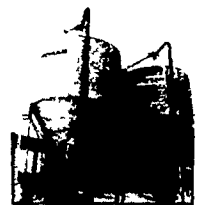
Today there's no need to put more nutrients in your bins than your hens need

The Agway Daily Nutrient Intake (DNI) feeding program gives your birds the nutrients they need for maximum production at the lowest possible cost. The simple and efficient DNI system prevents overfeeding of expensive protein while meeting your hens' daily requirements for amino acids and other nutrients