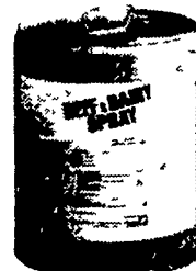
BEEF & DAIRY SPRAY