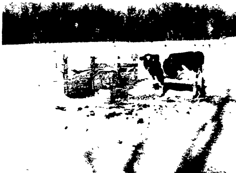
Freeze-proof waterer provides sanitary drinking facilities year-round for livestock. The waterer can be connected to pressure system or built into bank of fenced-off farm pond.

"Also, we utilize our own crane truck to provide easy on-farm installation of the various items."