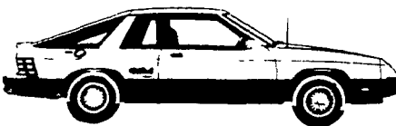
1981 DODGE OMNI MISER 0-24 HATCHBACK