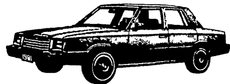
1981 DODGE ARIES K-CAR 4 DOOR SEDAN