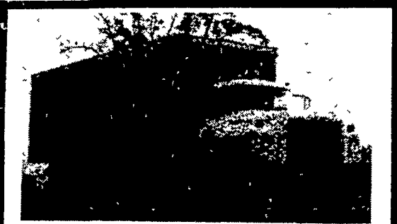
1977 International 1850, 466 Diesel Truck Eby Aluminum Body, 7' high inside, 25' long. 717-786-7229

For Sale - F600 Ford dump truck, 14' grain box, 21,000 GVW, double 3 stage cylinders 717 658-3200 Snyder Co