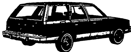
1981 DODGE ARIES K-CAR CUSTOM STATION WAGON