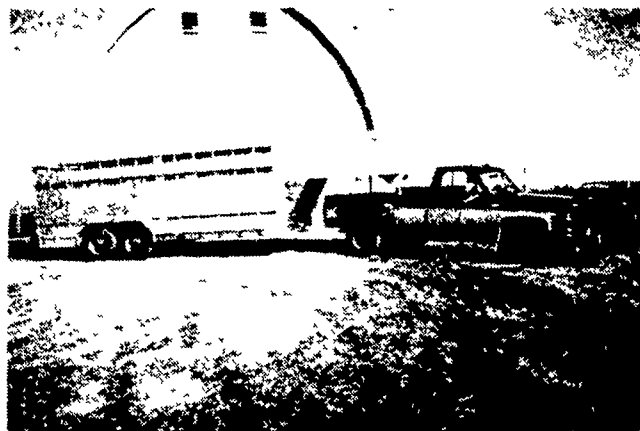
Gooseneck Livestock trailer GN720 pictured, available in 6, 7, 8' widths, - 10' to 38' lengths (Also for double decking)

WHEN IT COMES TO THE QUESTION OF WHO BUILDS THE BEST IN LIVESTOCK TRAILERS..IT'S US..