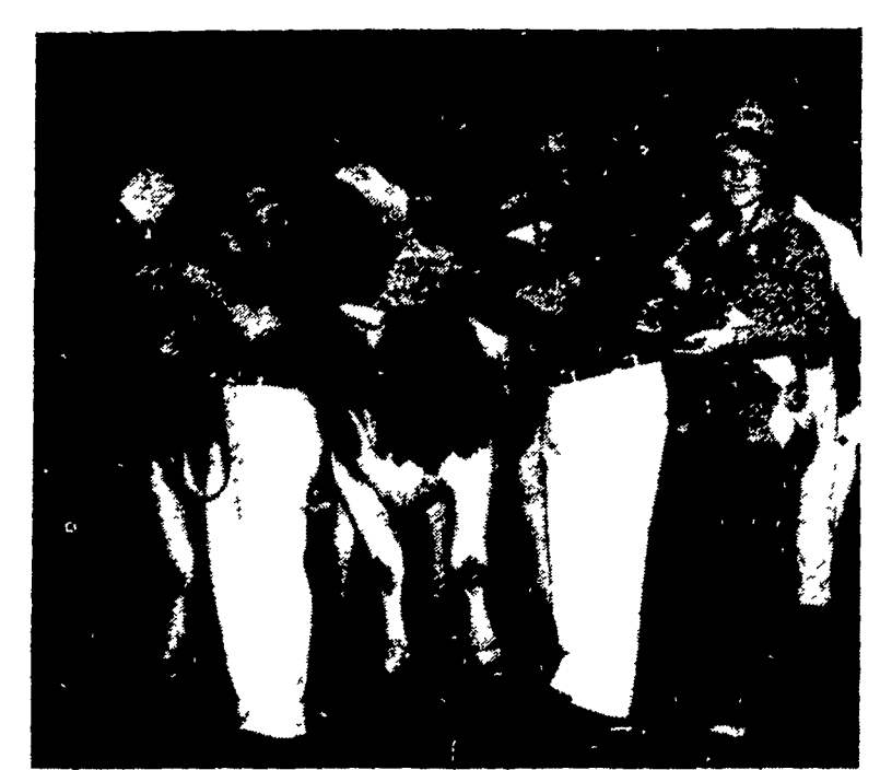
Berks County's Kerchenhill Holsteins captured the blue ribbon for Dam & Daughter

CLUB HERD 1 Bradlord ° Tiopa 3 Cumberland 4 Crawlord 5 Lancaster