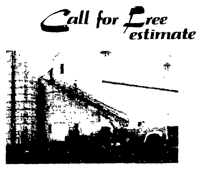
HYDRAULIC AERIAL EQUIPMENT