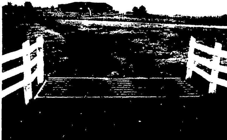
Saves a Lifetime of Gate Opening