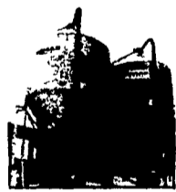
Today there's no need to put more nutrients in your bins than your hens need

Suppose, for example, your flock is eating 100 grams of feed per bird daily (22 lbs./100 birds) Under the DNI program, your feed would be