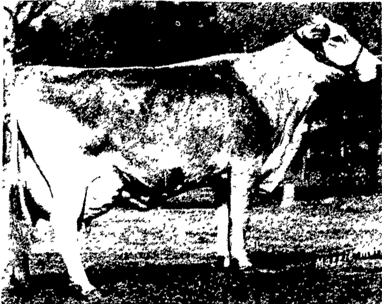
This Wind Mill stablemate, Vine Valley Patrick Hatty, is setting out to make her mark in the state's top Brown Swiss herd. Although she has only called the Schuylkill County farm home for the past two years, Hatty is helping keep its name on the top of the heap with a 365 day record closing in on the 30,000 pound mark with over 1200 pounds fat.