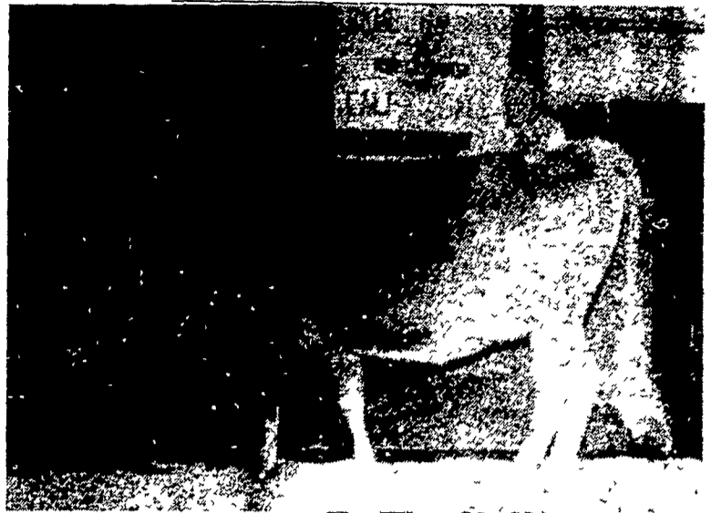
Hollow View Top Command Holly was top selling cow at the Guernsey sale, bringing the same amount as the top selling calf, $4700. She was purchased by Boulder View Farms from Baraboo, Wisconsin.