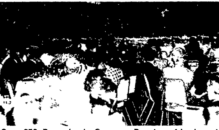
Over 250 Pennsylvania Guernsey Breeders, friends and family members attended the anniversary of the Association Friday night at the Host Farm in Lancaster.