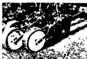
Tye offers the most complete line of press wheels on the market to assure you total control drilling.

"Till a trail" through the stubble with Tye's new STUBBLE DRILL. Individually mounted spring swivel coulters with 1" wide fluted blades "till a trail" through stubble, straw and other crop residue preparing a mini seed bed. For over 16 years farmers have been counting on Tye for tough, reliable equipment. Tye sets the pace with most complete line of drills—sizes, types and accessories on the market.