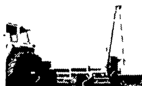
The Tye folding row marker provides wide marking widths without tall marker arms.

PLEASE CONTACT YOUR LOCAL DEALER OR - HAMILTON EQUIPMENT, INC. WHOLESALE DISTRIBUTORS