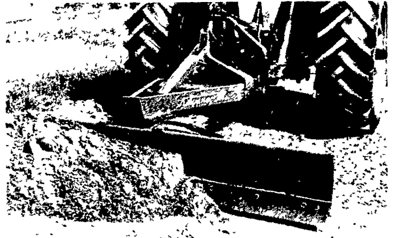
Tractor blades are designed to push or pull things — not hit them. He advises farmers to take time, moving big loads with two or three passes rather than taking the whole load on once.

Sudden jolts from hitting objects could unseat the tractor operator. Consequently,