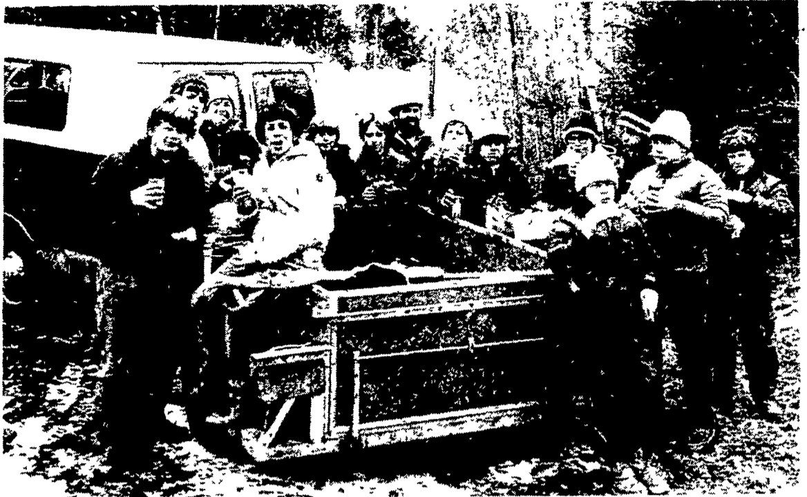
Thirteen members of the Ephrata Junior Agriculture Club participated in a three-day field trip to northern Pennsylvania. The busy schedule they followed barely left room for lunch.