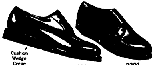
Cushion Wedge Crepe