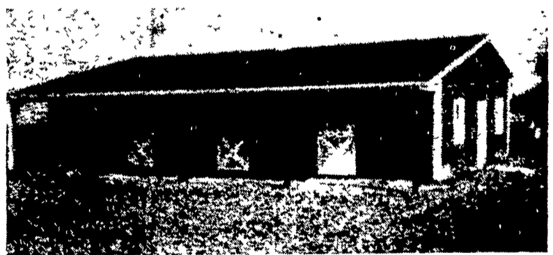
Backyard Horse Barn

We Have A Skilled Crew Available For Erection if Desired