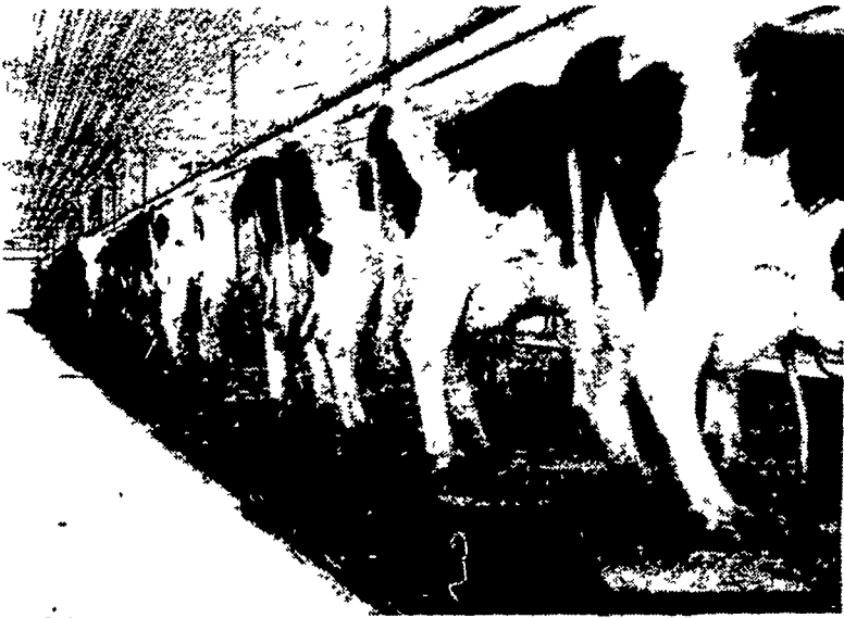
With stalls projecting out over the grated manure gutter, milkers can be hooked up to the pipeline and attached to the udders with a minimum of bending and kneeling between animals.