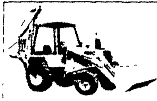
Case 580C Wheel Loader