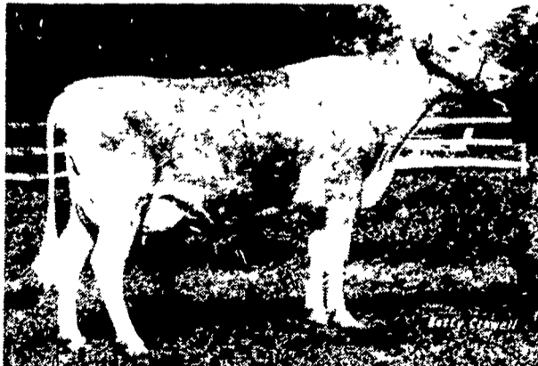
GREYSTONE CHOICE ANNE V Lovely uddered CHOICE daughter 2-07 15384 643 305 2x DHIA pend