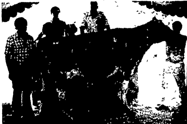
GERAR TOP GRETEL Top 1980 Ontario Classic at 6100 1st Place 4 Yr Old C N E 1980