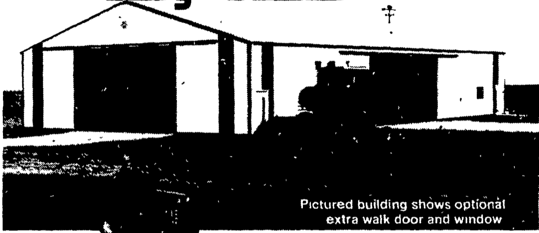
Pictured building shows optional extra walk door and window

54 X 72 machine storage building • 24 X 14 double end door • 18 double side door • Walk door with glass • 4 sky lights • Length may be increased in units of 9' at $1 127