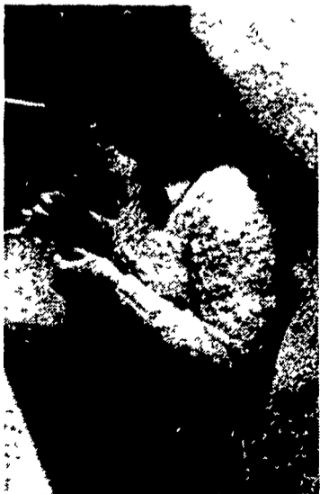
A lot of concentration is needed to learn some of these old-time crafts.