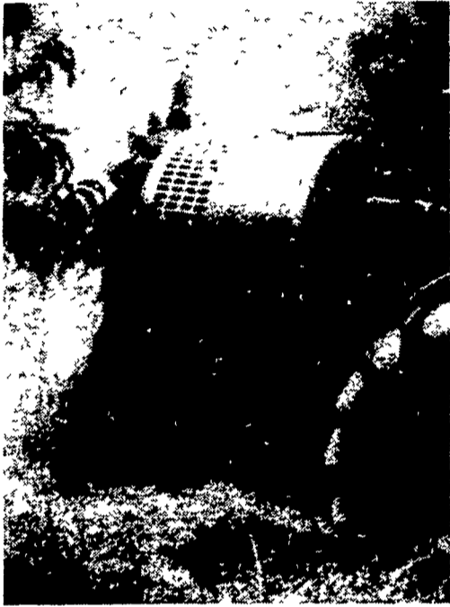
RB-26-100 3 Pt. (Shown Above)

A NEW 3 POINT HITCH SPRAYER WITH SEVEN INTERCHANGEABLE HEADS