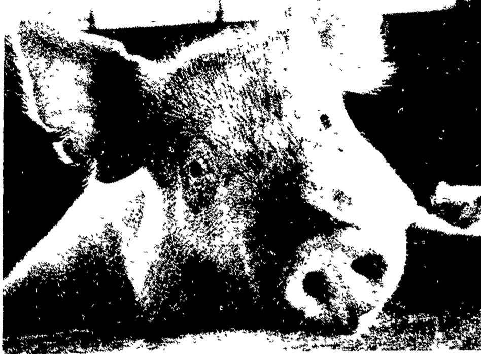
"Here comes another day of just sitting in the mud. It's so boring. I'd rather just sit in Liquid Gold. I guess that's how Porky Pig got so rich. I bet he didn't have it this bad."