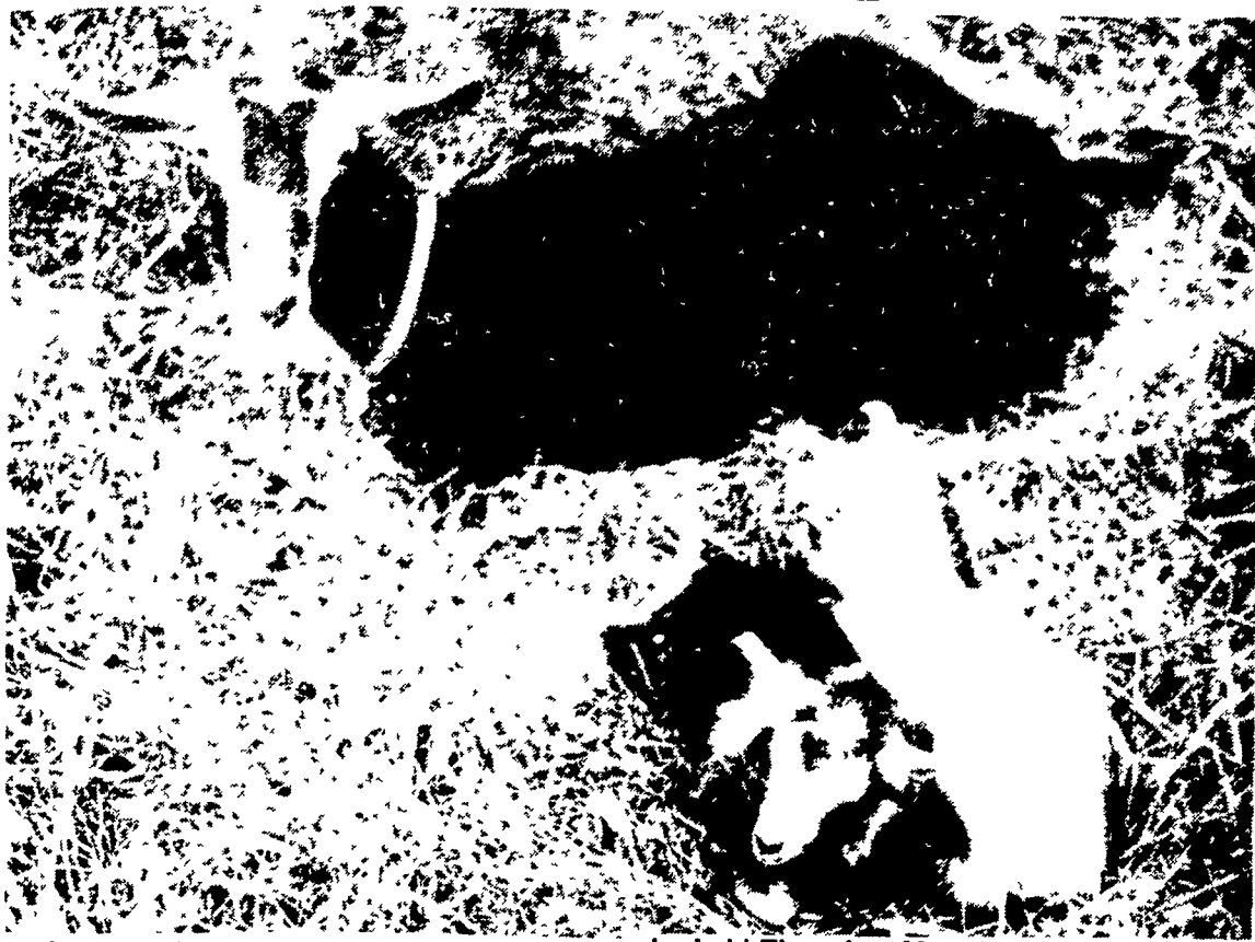
Goats made their debut at last year's Expo. This year they will have their own full-fledged show. The First Spring Classic Goat Show will