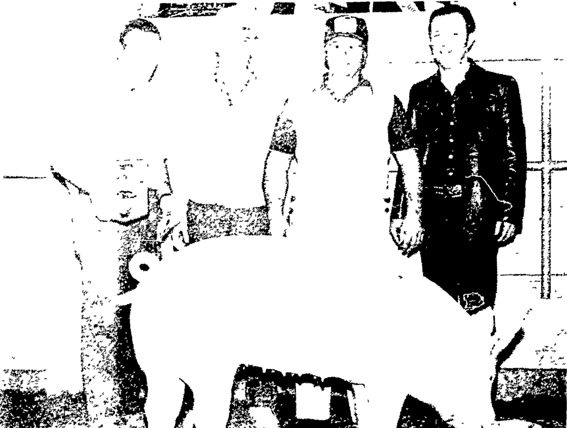
The 2nd Keystone Classic Swine Show and Sale will pit breed against breed for grand championship honors in both bred and open gilts and boars. Last year's top selling animal was the grand champion open gilt, exhibited by