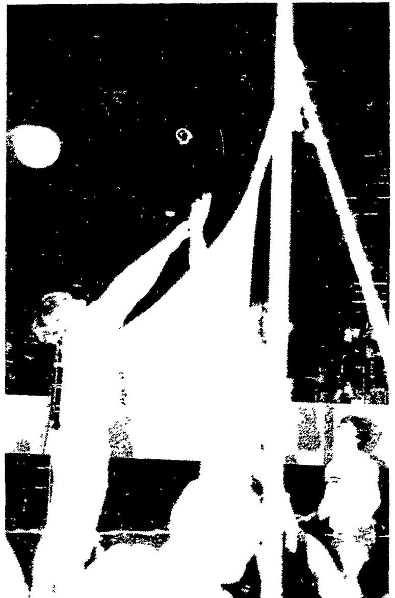
The Young Farmers will be spiking it out for the championship in the Expo's volleyball tourney. The teams will serve up a lot of exciting competition starting at 11 a.m. Saturday in the Farm Show Complex large arena as the Ephrata team attempts to hold on to the championship title.