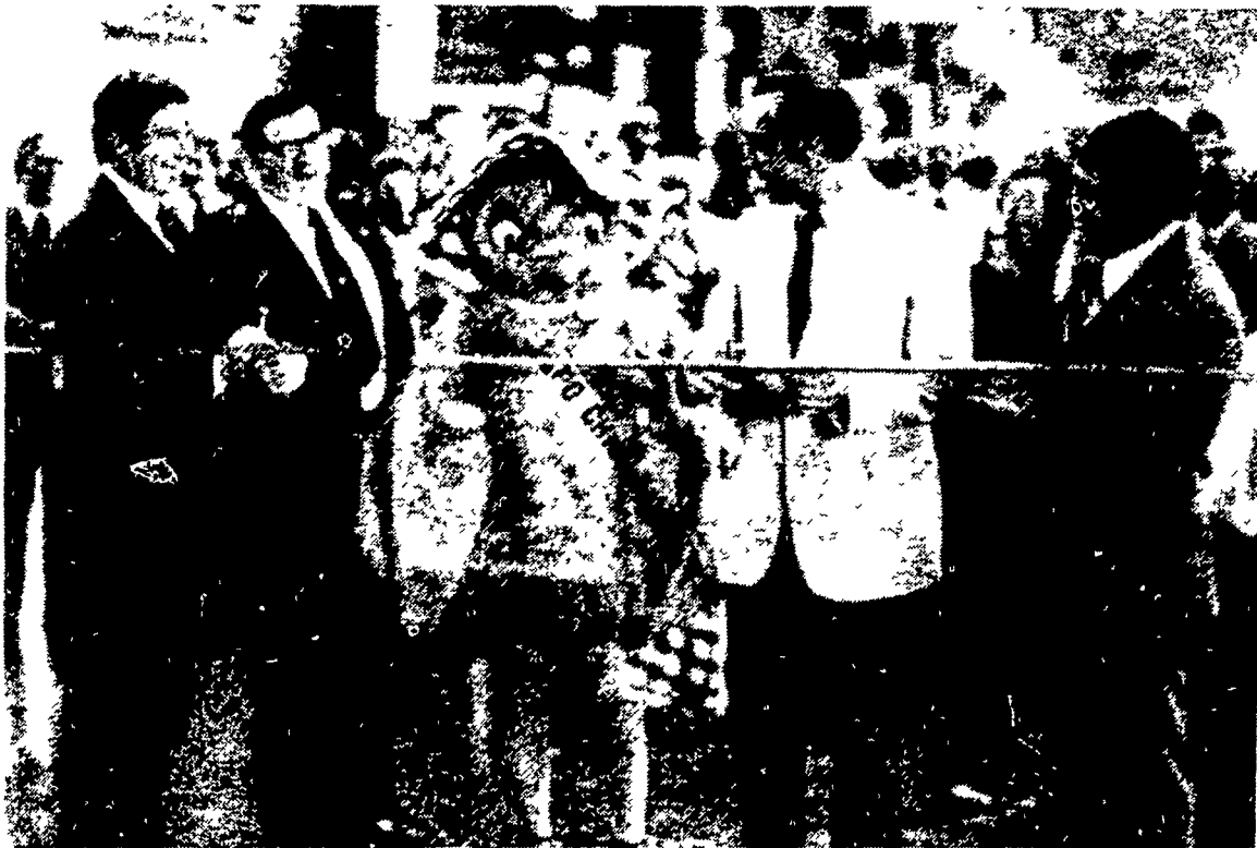
Dignitaries and state officials have the honor of cutting the Farm Equipment Expo ribbon to open the doors of the Farm Show Complex for three days of livestock, machinery, and pulling contests measuring two kinds of horse power. The Expo Main Floor

opens at 8 a.m. Thursday, March 5 and Friday, March 6 and closes at 8 p.m. on both days. Saturday's hours are from 8 a.m. to 6 p.m. Evening attractions in the large arena start at 7 p.m.