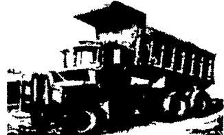
Mack 10 Wheeler