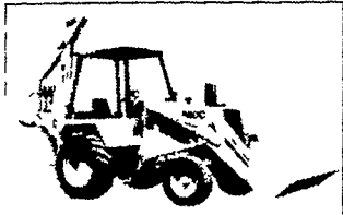
Case 580C Wheel Loader