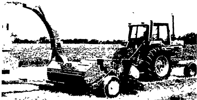
New IH 781 forage harvester is designed for moderate-sized farms.

CHICAGO — Two new forage harvesters have been introduced by International Harvester.