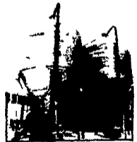
Today there's no need to put more nutrients in your bins than your hens need

The Agway Daily Nutrient Intake (DNI) feeding program gives your birds the nutrients they need for maximum production at the lowest possible cost. The simple and efficient DNI system prevents overfeeding of expensive protein while meeting your hens' daily requirements for amino acids and other nutrients