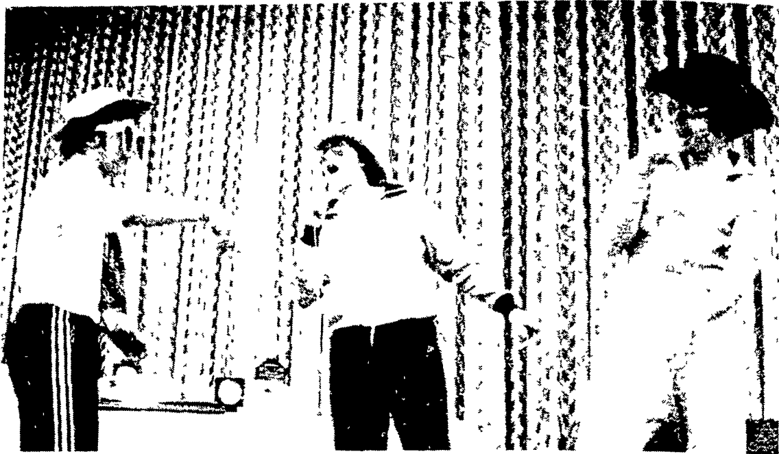
These shady-looking characters made up a trio called "The Clucks" at the 4-H banquet.