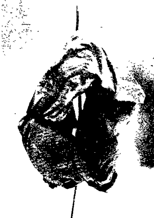
Turning ever so slowly on its spit, the mortgage document for the Farm and Home Center ceases to exist. The mortgage burning highlighted the Farm and Home Foundation banquet Thursday.