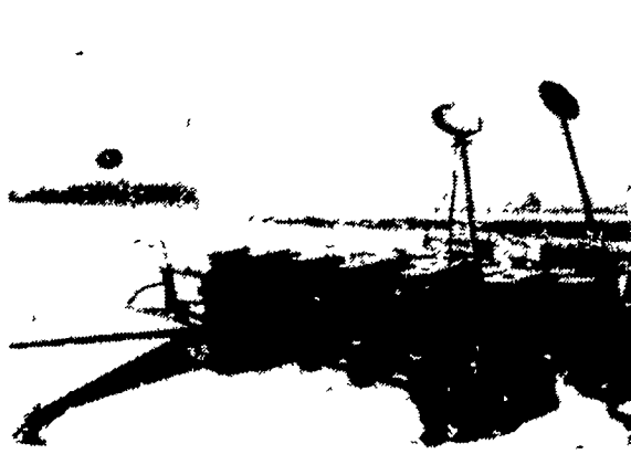
John Deere 1250 6-Row Plateless Planter. $2150