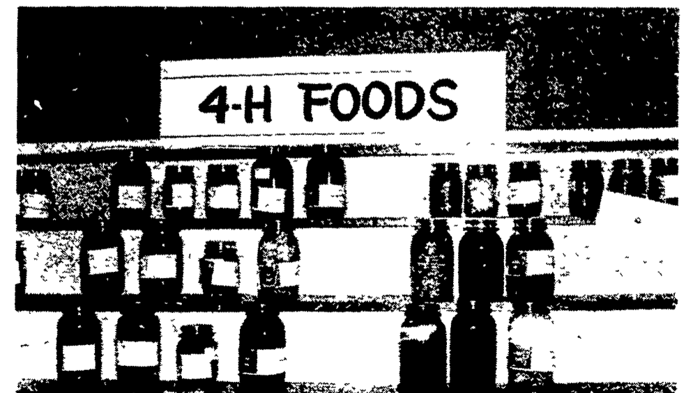
Diene Mishler, Holsopple R2, of Somerset County, took most of the blue honors in 4-H canned foods competition.