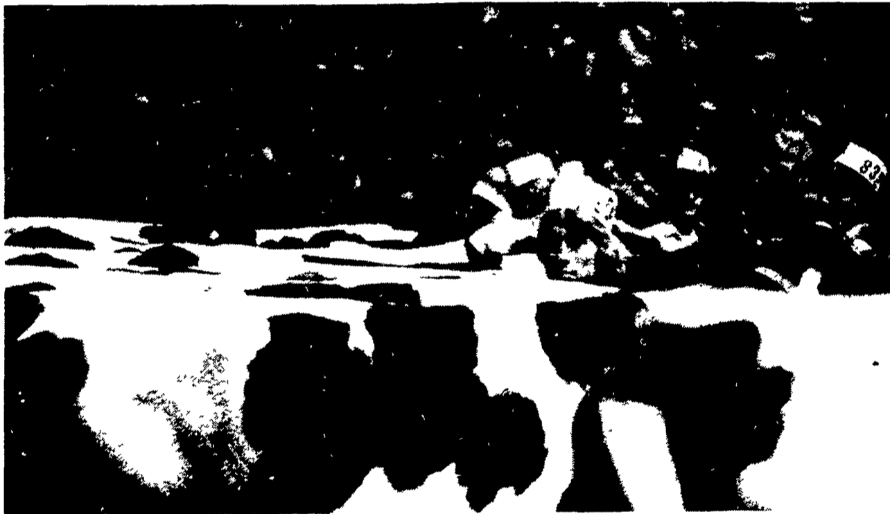
A competitor peers out from what seems to be a Holstein sea on Tuesday afternoon at the Farm