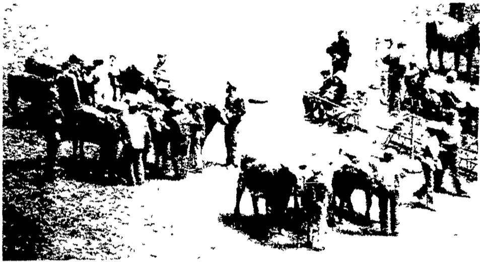
Competition in progress during dairy competition at the Pennsylvania Farm Show on Tuesday.

Hordes of spectators trooped through the barn from the time the Farm Show doors opened in the morning until late at night. And in the main arena, Ace noted that the crowds of spectators seemed bigger than usual.