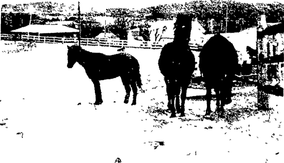
The Mt View brood mares sport shaggy winter coats. The Sweigarts have 23 Hackney ponies in their breeding program and show barn