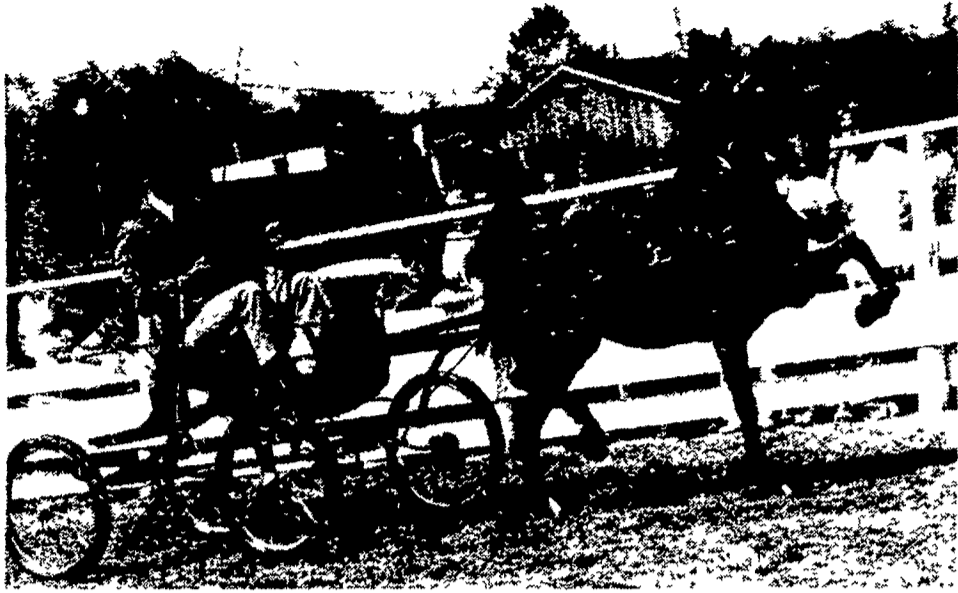
Three-year-old Callaways Little Jewel, a Hackney filly, took first place in the Zone 2 Harness Division and was named All-American Three-Year-Old