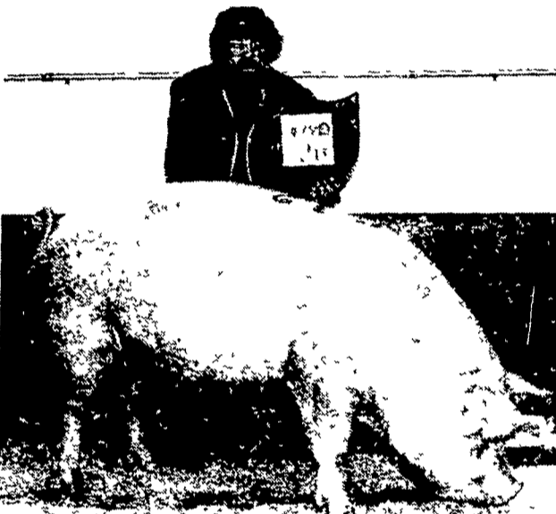
Calvin Lazarus & Sons, White Hall, Lehigh County, exhibited the champion and reserve champion Yorkshire bred gilt. Both champs were sired by Legend. (There are a series of pics of the champion and reserve champ — champion is first)