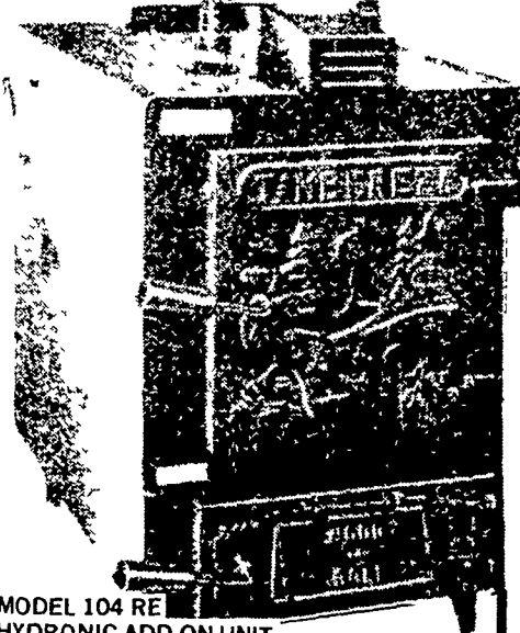
MODEL 104 RE HYDRONIC ADD-ON UNIT

TESTED TO UL 1102 STANDARD FOR RADIANT HEAT BY AN INDEPENDENT LABORATORY