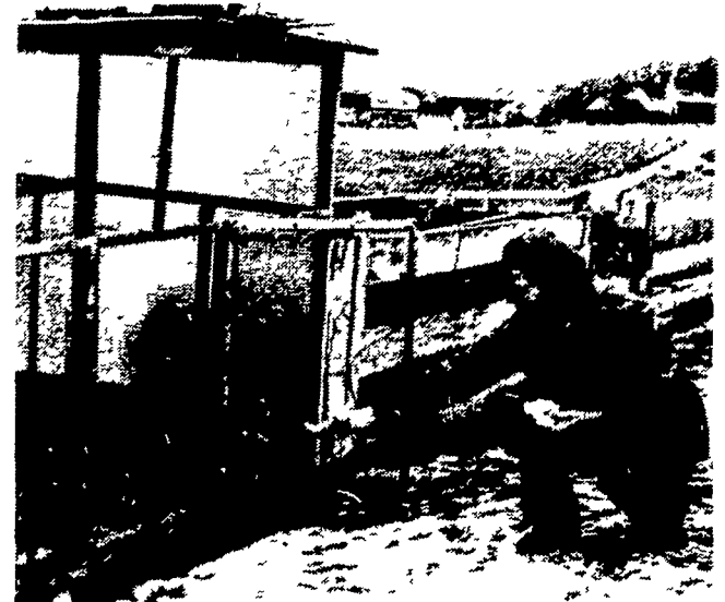
Birds of different feathers flock together in the Flory family's poultry collection, including Jackie Flory's pet peacock, shown here nabbing a snack of bread bits.