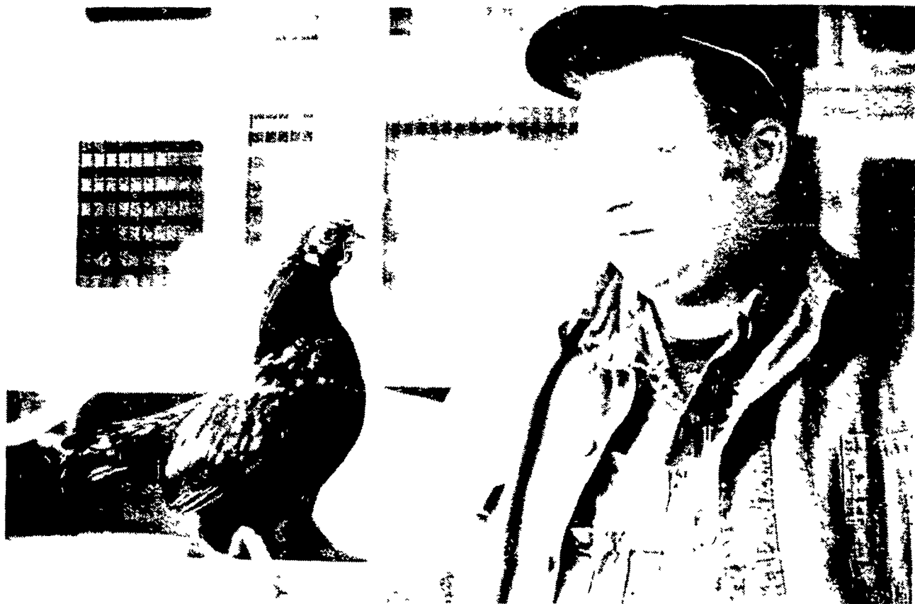
One of Don Flory's most recent show poultry additions is this small, but solid-built, Dark Cornish bantam.