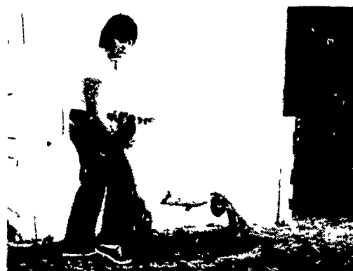
A Changer Son in the Winners Circle