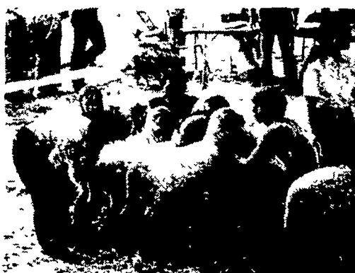
A Group of Changer Lambs 1979 Montgomery County Fair