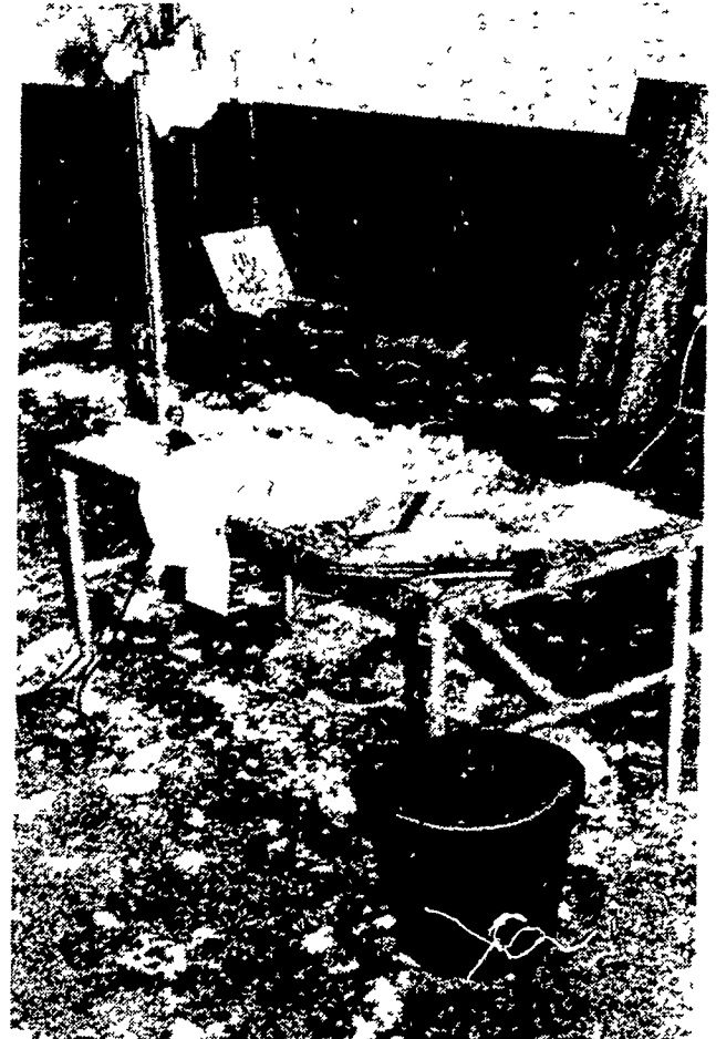
Getting an animal ready for competition takes time, skill, and a lot of elbow grease. It's a hectic, harried week for most exhibitors.