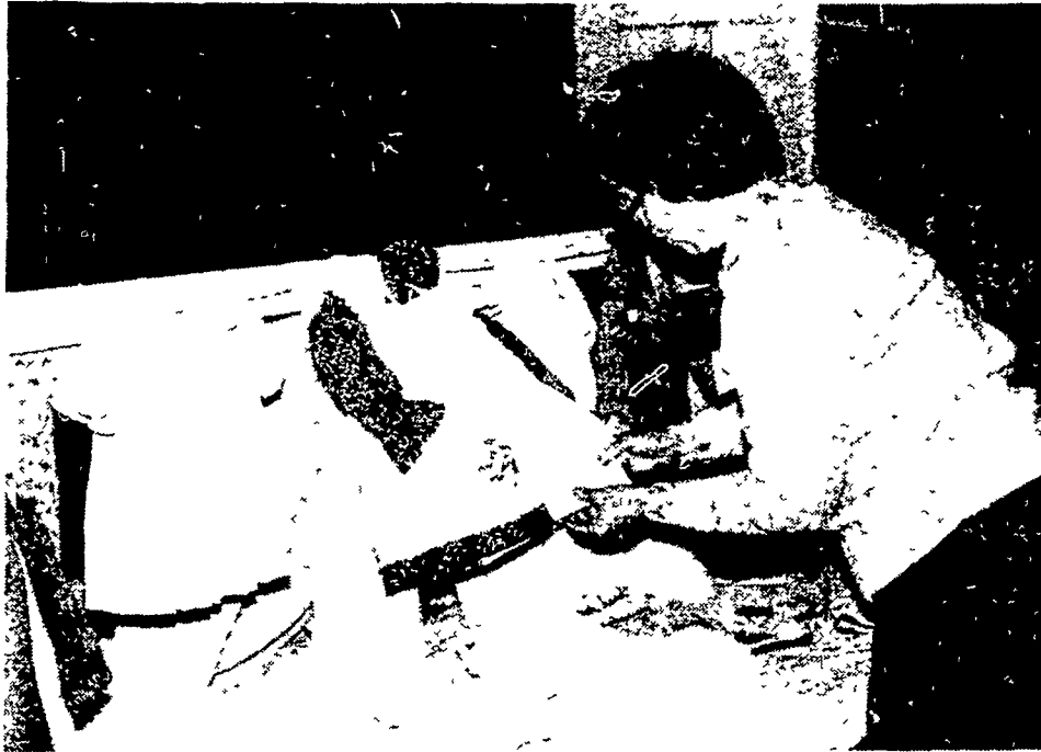
Canning and clothing entries fill the home economics wings of the complex.

The Pennsylvania Farm Show is sponsored by the Pennsylvania State Farm Products Show Commission in cooperation with the Pennsylvania Department of Agriculture.