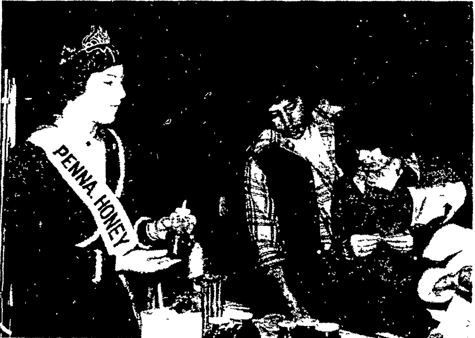
Pennsylvania Commodity Queens will be greeting Farm Show visitors with special product samples.