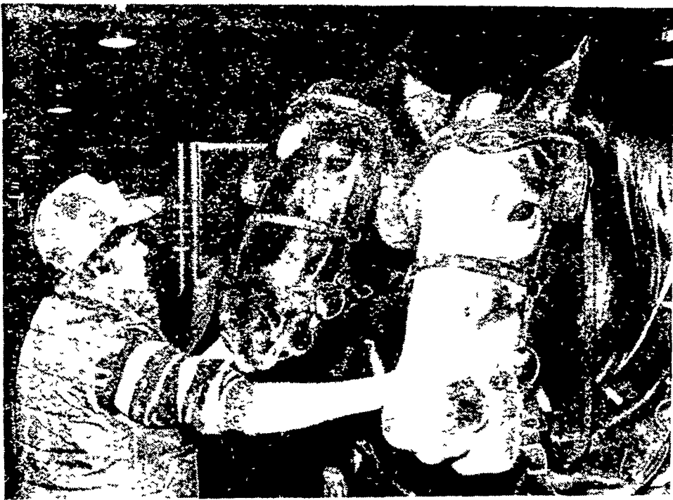
Farm Show crowds will thrill to the strength and endurance of the huge draft horses as they compete in the pulling contest.