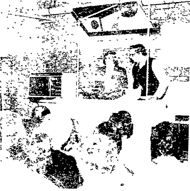
You can bet the 1917 Farm Show didn't feature demonstrations on using a microwave oven and an electric wok.