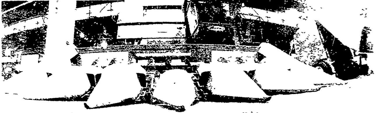
Agriculture machinery in the 1980's has taken on a different look than the equipment used on the farms just before World War I. This self propelled