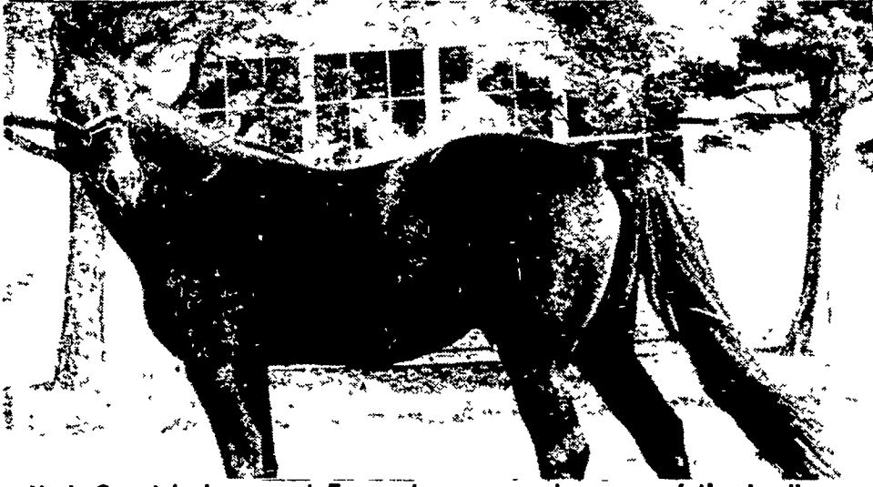
York County's Lauxmont Farms has emerged as one of the leading new Standardbred horse farms. One of their stallions, Tarport Adios, is standing at stud on the 1400-acre Wrightsville breeding complex.