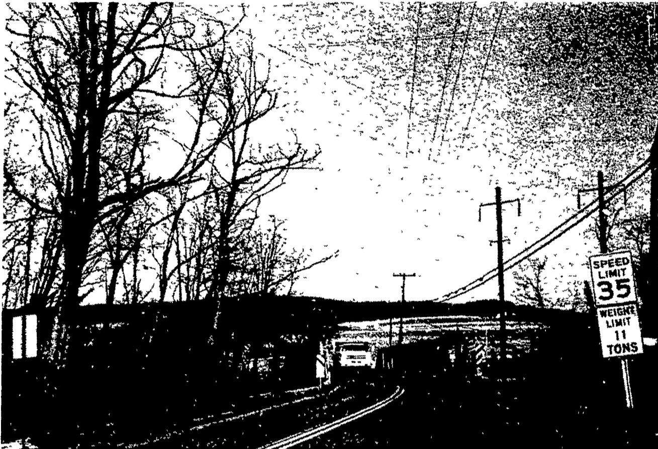
A loaded truck much larger than this one would not be able to cross the bridge on Rt. 372 east of Quarryville. To avoid the 11 ton weight limit, most big rigs detour along Rt. 472 which turns off just

In all, the industry leader projected a decidedly positive outlook for '80-'81. "Farmers will really farm in the year ahead - and they will be farming on a rising farm market"...a mere ideal market situation for fertilizer sales, he said.